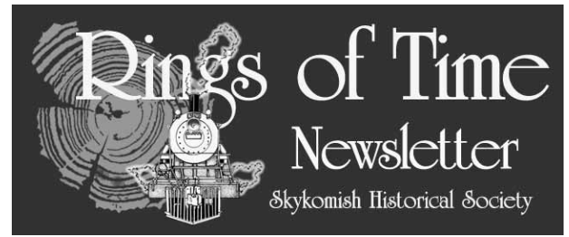
Summer 2012 - www.dflatblues.com/SkykomishHistoricalSociety

Donations may be sent to: Skykomish Historical Society, Attn: Capital Campaign, P.O. Box 247, Skykomish, WA 98288